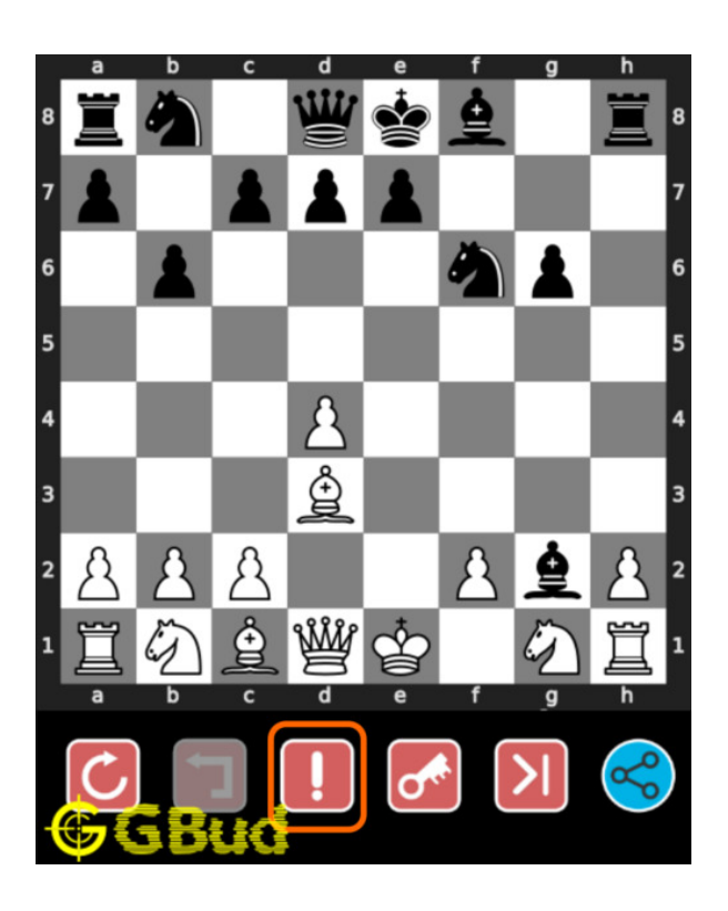
Figure 6: Click the help button to get help on next move @ https://gbud.in/ghj2pd1