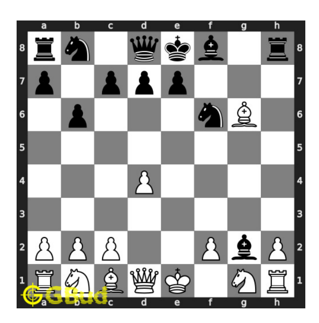
Figure 4: Bxg6# - Your bishop captures the opponent's pawn and checkmate. There are no pieces to capture your bishop and the king is blocked by friendly pieces. This is how you can mate in one move